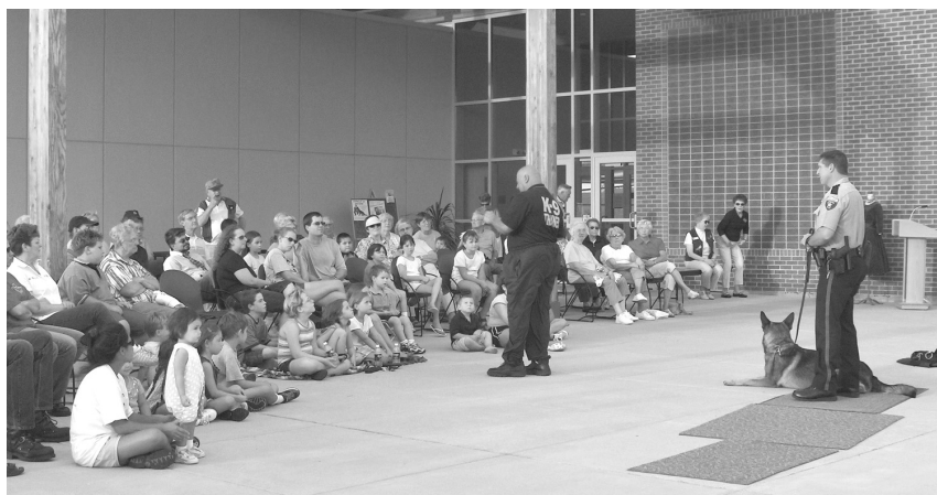
Adults and children learned how dogs and handlers are trained for law enforcement on August 17.

There is a new feature in the library lobby that should interest all ages and which may entertain children while parents check out books. It reflects one area of our purchasing during the past year, and it should add a little 'life' and movement to our building. Come see what this new feature is!